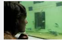
Howard Laboratory 50th Anniversary