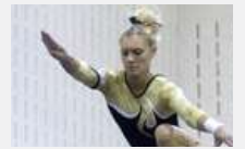
Gymnastics RBC at Freehold Boro