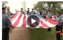
Final Retreat At Fort Monmouth (9/15/11) Sep 15, 2011