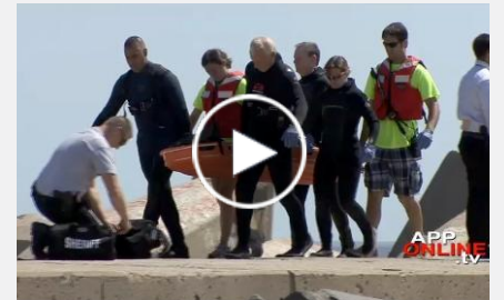
Bodies Found In Manasquan Inlet Jetty (8/29/11)